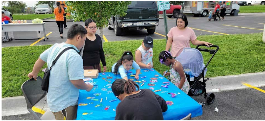
Pictures at the beginning of the August Back to School Literacy Bash: